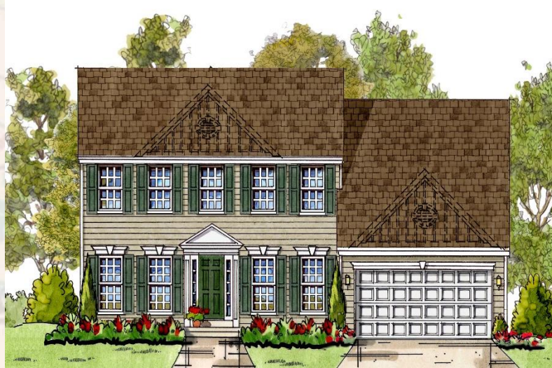
Colonial Elevation # 1