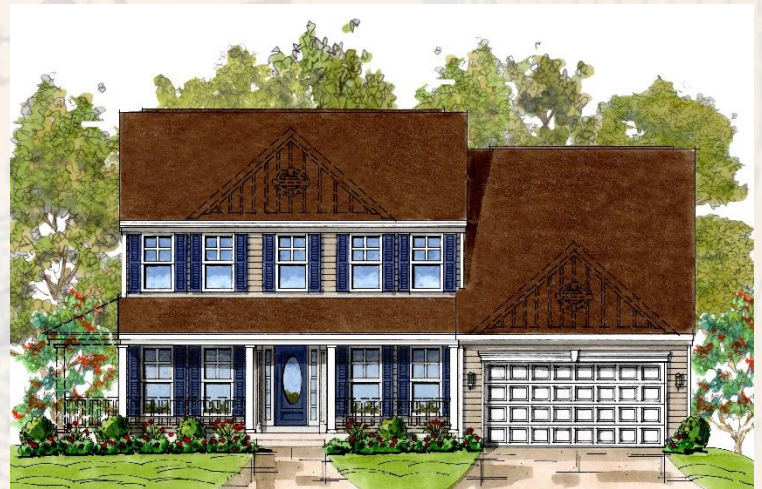
Farmhouse Elevation # 3