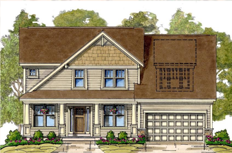
Craftsman Elevation # 2