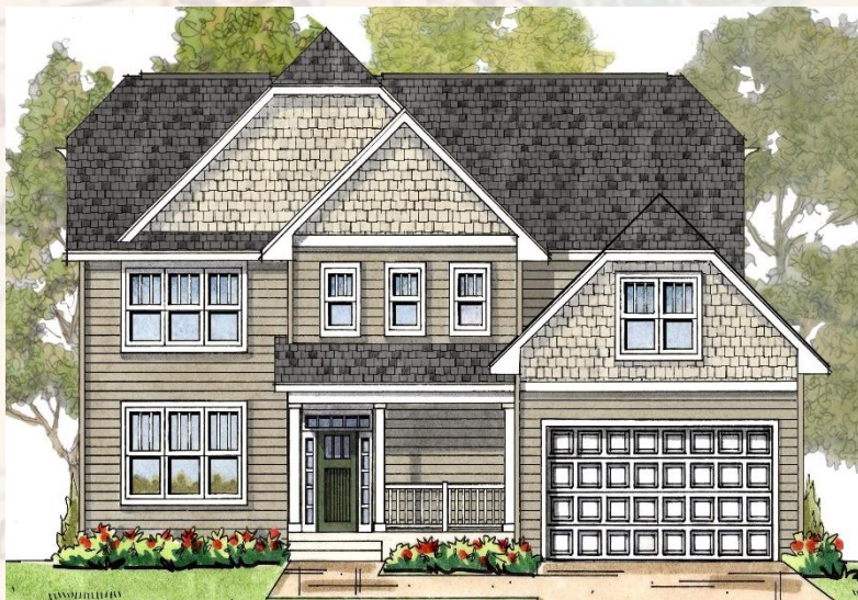
Craftsman Elevation #2