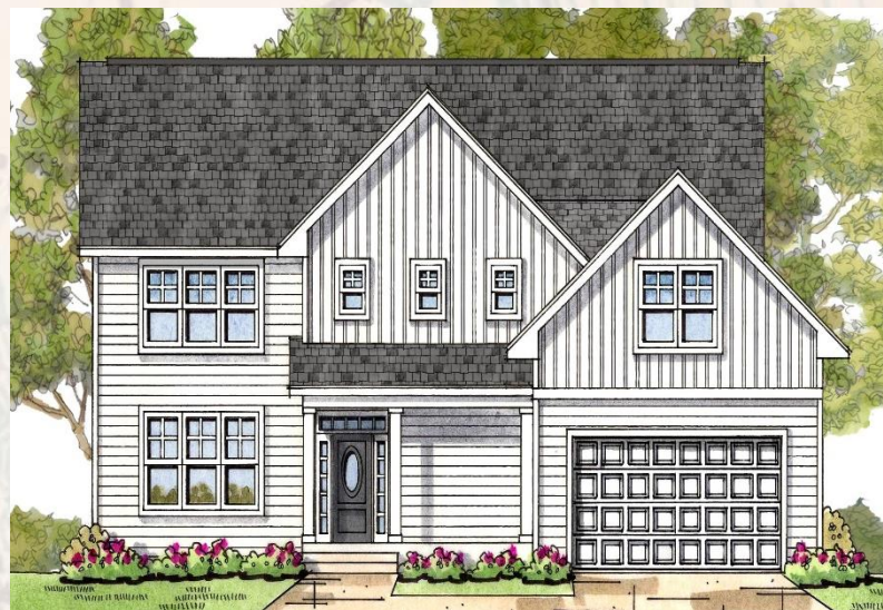
Farmhouse elevation #3

3266 SQ FT +/- 4 Bedrooms, 3.5 Baths, 2 Car Garage