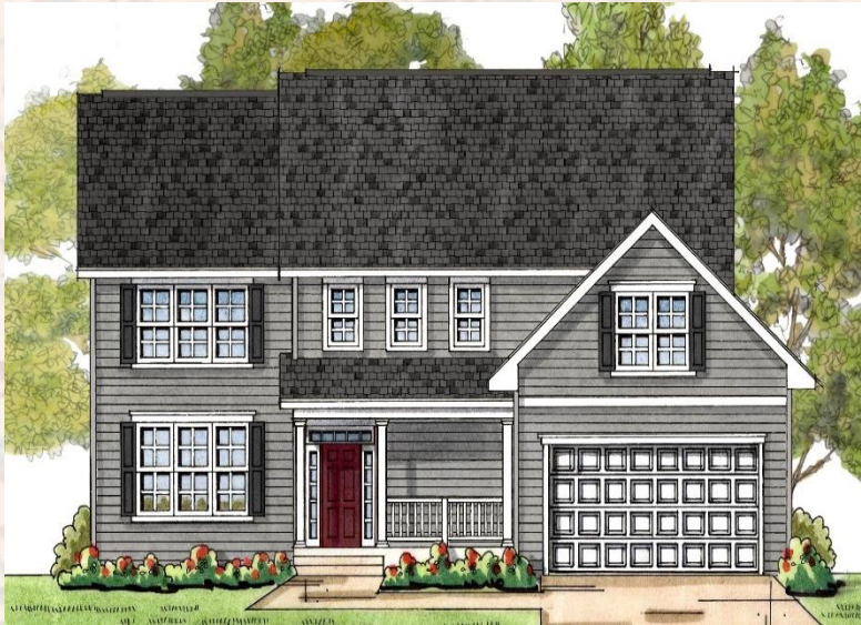
Colonial Elevation #1