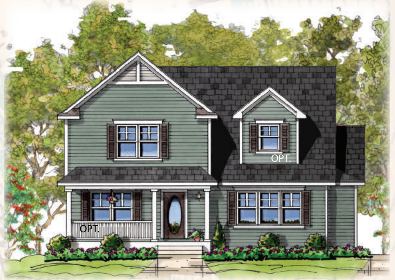
Elevation # 3- Farmhouse