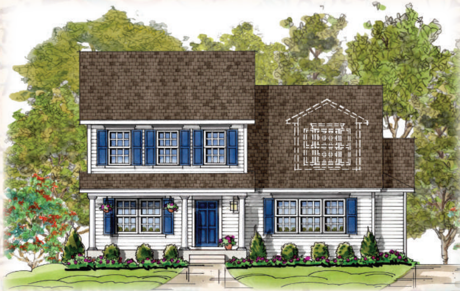
Elevation # 1- Colonial