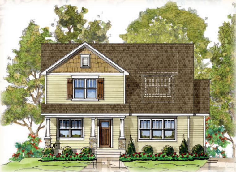
Elevation # 2- Craftsman